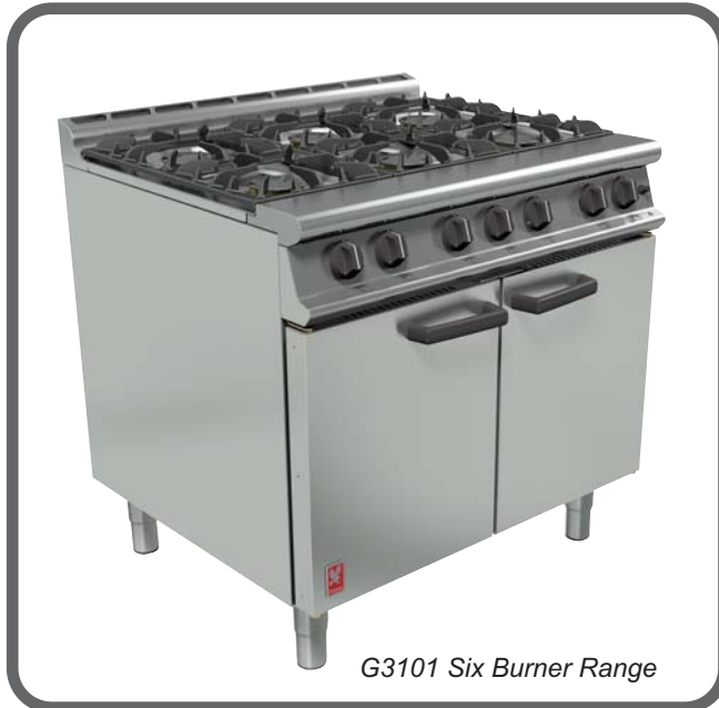
G3101 Six Burner Range